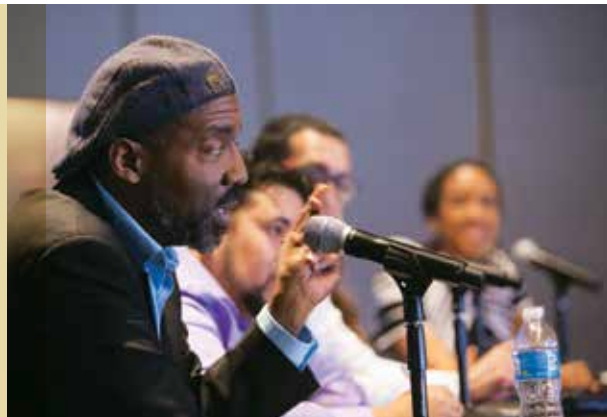
LESTER SPENCE (FOREGROUND) AND FELLOW PANELISTS AT “BLACK POLITICS AFTER OBAMA.”

People need to understand that all voting is important, said Lester Spence, who teaches at Johns Hopkins. “Unless we have some type of black political force that mobilizes those constituencies not just to vote at a national level, not just to vote for presidencies, but to really take control of their cities, then what we’ll see is a backlash that has a local component,” he said. What Trump’s election represents, said Spence, was not just a national phenomenon of white nationalism but an international one. “We are seeing more people get involved, but what we’re also seeing is a transnational, white nationalist movement that’s making an aggressive intervention and destabilizing a range of norms that we associate with democracy,” he said.