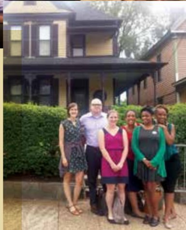
RIGHT: GROUP PHOTO IN FRONT OF THE MLK JR. BIRTH HOME.