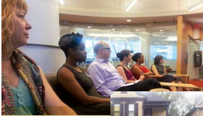
VISITING SCHOLARS DURING ORIENTATION